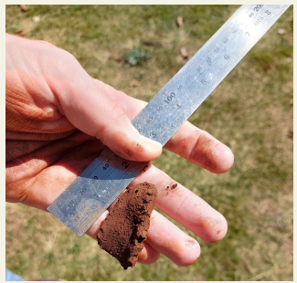
Step 4: Measure the length of ribbon. Compare results to the look-up table on the next page.