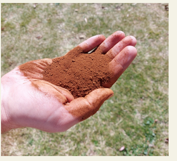
Step 1: Collect enough soil to fit comfortably into the palm of your hand. Crush any lumps of soil, and remove stones and plant material.

Soil scientists in Australia recognise about 15 types of field texture (e.g. sand, clayey sand, sandy loam, silty clay loam, light clay, heavy clay). A simpler approach is to break the soil into three general groups: sandy, loamy or clayey. Sandy soils do not form a ball when a moist sample is squeezed in the hand. Loamy soils will form a ball when moist, but will not form a ribbon more than 5 cm. Clayey soils form a ball when moist, and also form a ribbon more than 5 cm.