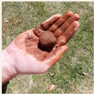
Step 2: Add water to the soil sample, a little at a time, and knead the soil to make a small ball (about 3–5 cm in diameter) that sticks together and is moist. Knead/work the ball for a minute or two (until there is no apparent change in the feel of the ball).