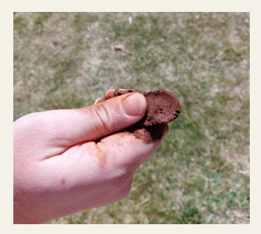
Step 3: Press the soil between your thumb and forefinger to make a ribbon. Attempt to keep the ribbon about 2 mm thick and continue ribboning until the ribbon breaks.