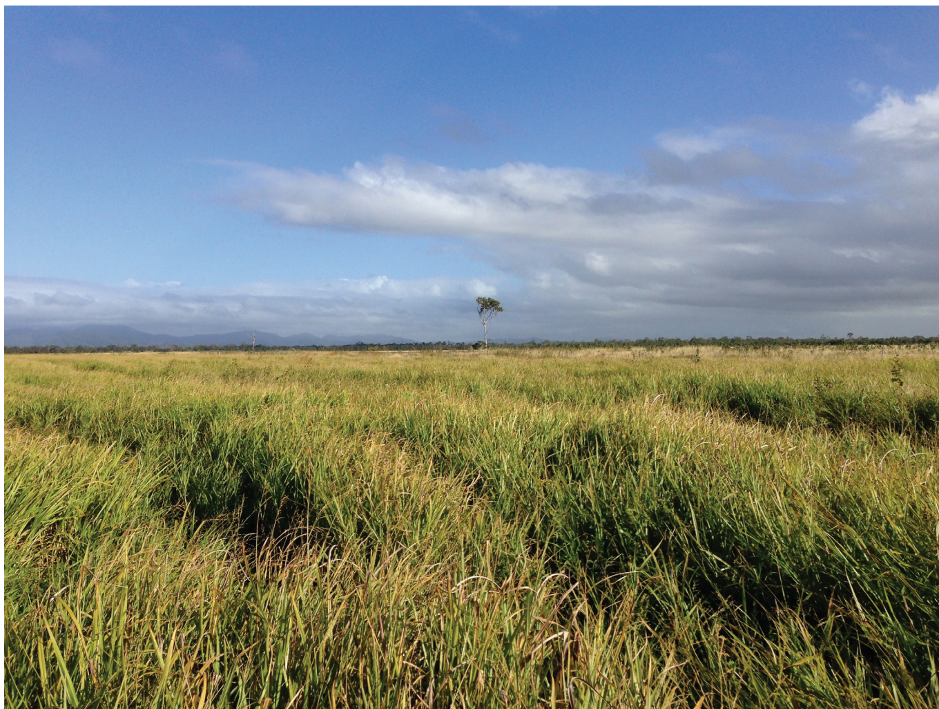
Pasture in the Whitsunday Region