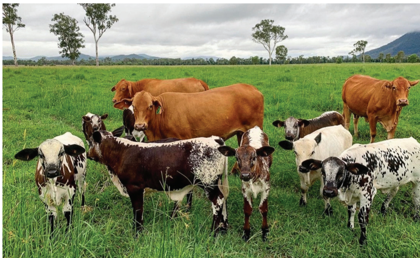
Cattle grazing at Blair Plains