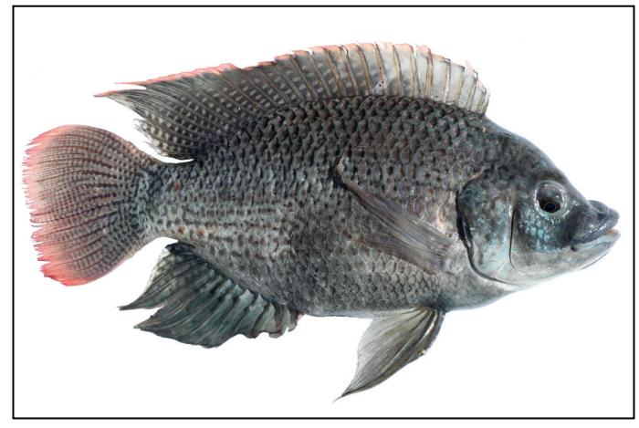
Male Mozambique tilapia