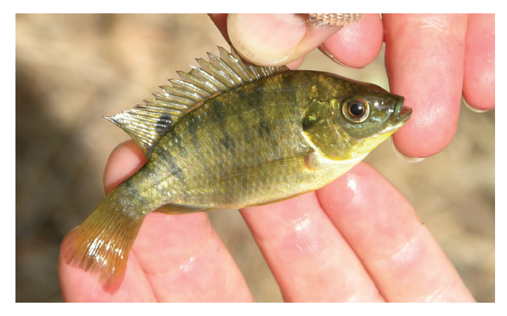
Juvenile Mozambique tilapia