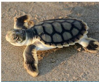
FLATBACK TURTLE HATCHLING